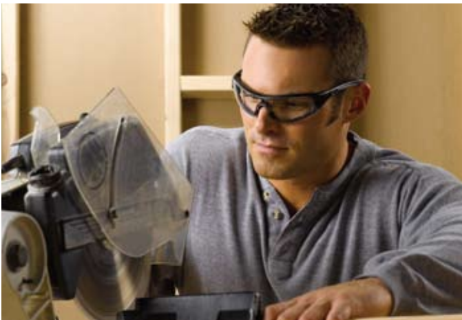
Soft, smooth foam lines the frame to block dust and debris. Venting channels help minimize fogging.