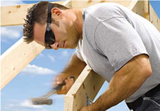
Two products in one, with temples for safety glasses and a head strap for safety goggles.